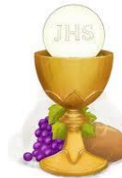
Host and chalice

Whenever you eat this bread, and drink this cup you are proclaiming the Lord's death until he comes.